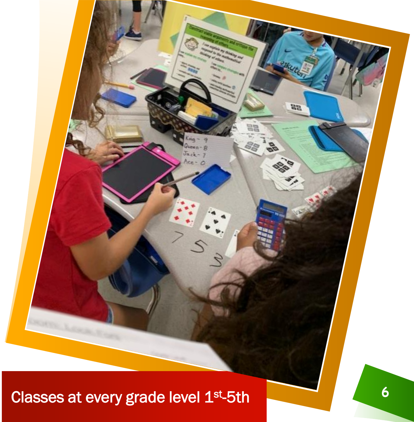
Classes at every grade level 1 st -5 th